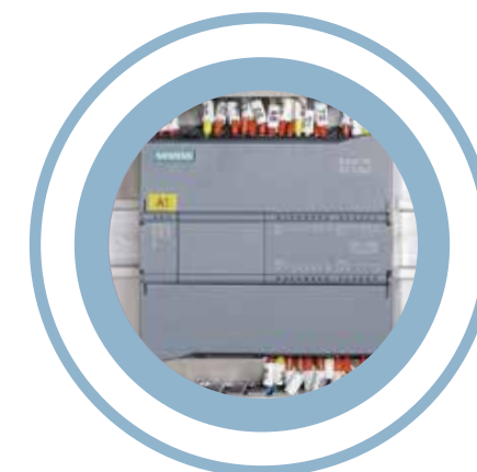
Siemens PLC Control