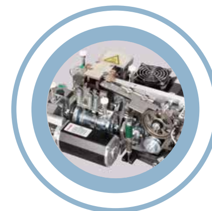
Robust & Compact Mechanical Strapping Head