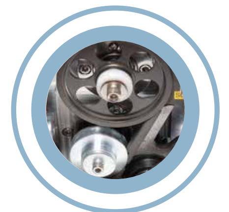
Free Access To Strapping Guide

CONTACT BINGHAM FLEXO SERVICES TODAY FOR MORE INFORMATION